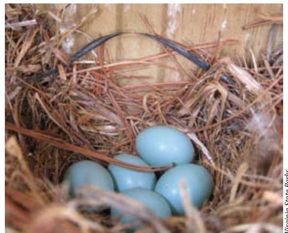
Virginia State Parks