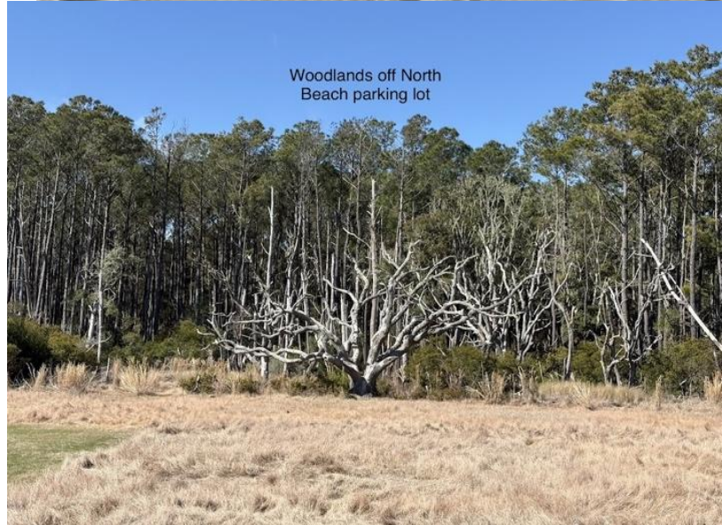
Woodlands off North Beach parking lot