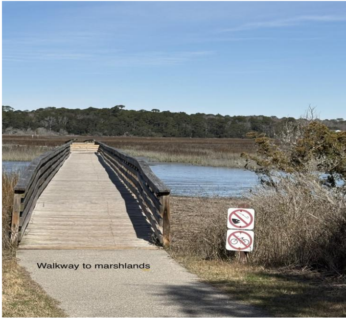
Walkway to marshlands