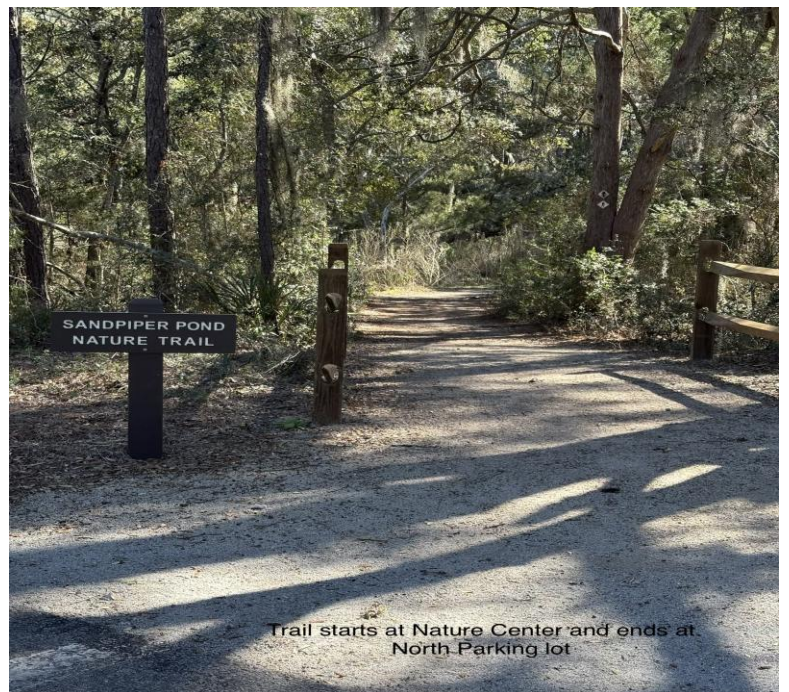
Trail starts at Nature Center and ends at North Parking lot