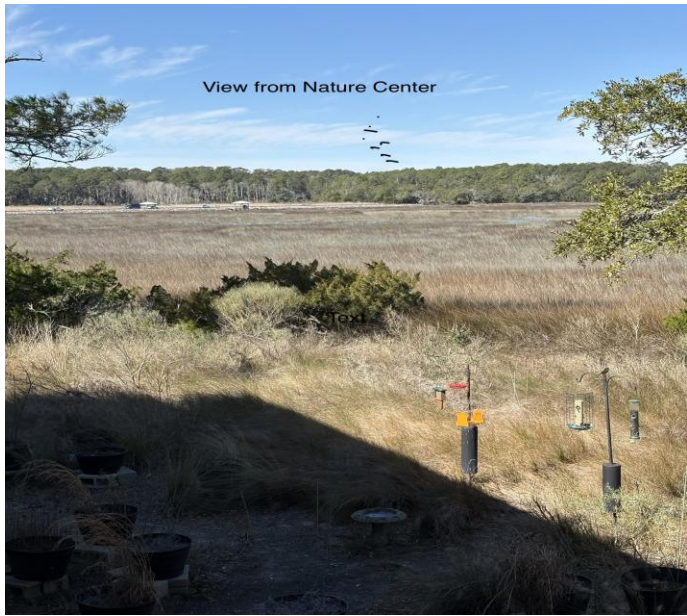
View from Nature Center